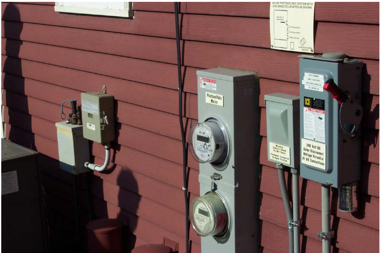
http://bit.ly/2bBpged • Matt Montagne

installer. The first question when comparing proposals is an important yet simple one: What is the total system cost?