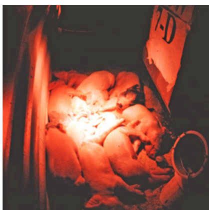
Figure 2. Posture of seven-day-old piglets underneath two different wattage lamps, 250 W on left and 175 W on right.